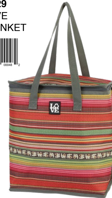
BC67 PINEAPPLE EXPRESS