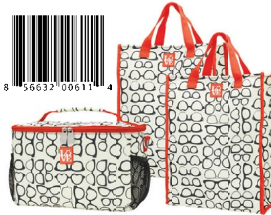
CS62 SUNNY SHADES