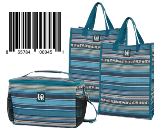
CS73 BLUE BLANKET