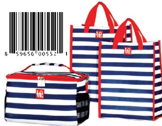
CS22 ANCHORS AWEIGH

EASY LOADING Stands up on its own even when it is empty.