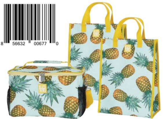
CS67 PINEAPPLE EXPRESS