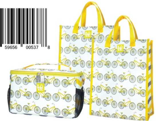
CS50 PEDAL POWER