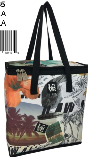
BC74 LOVE BAIT