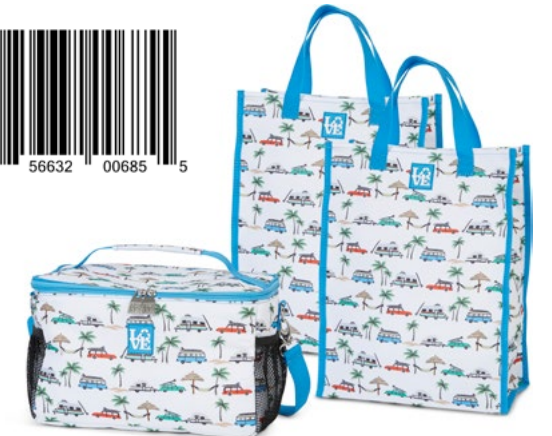
CS68 CAMPERS *Limited Availability