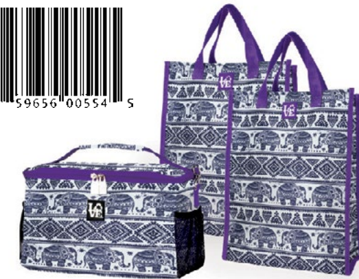
CS51 ELEPHANT IN THE ROOM