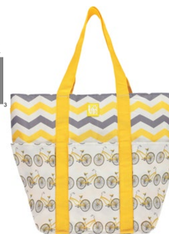
TT76 BEE IN LOVE