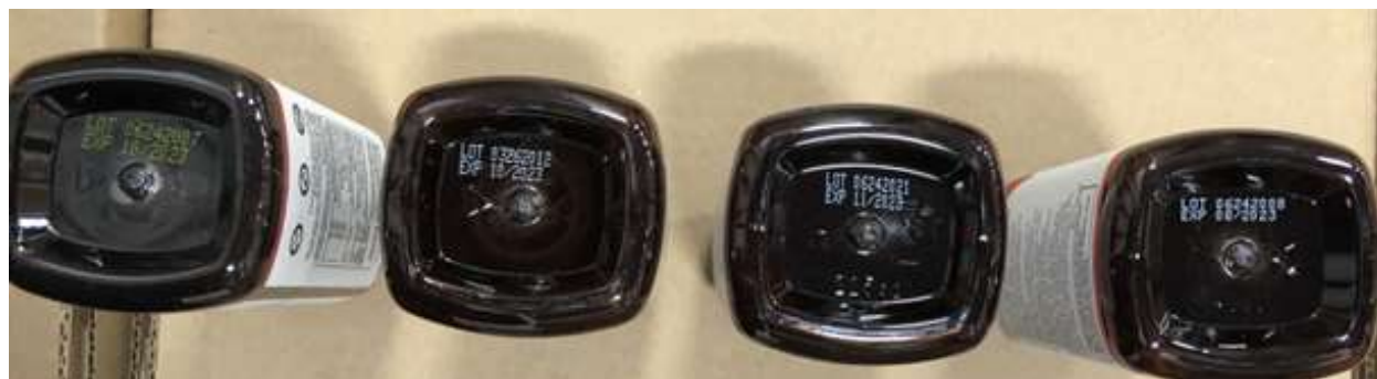
Recalled LifeSeasons Blood Nourish-R™ (60 Capsules) Lot Number and Expiration Date