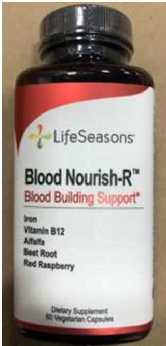
Recalled LifeSeasons Blood Nourish-R™ (60 Capsules)