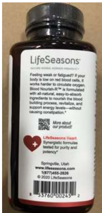
Recalled LifeSeasons Blood Nourish-R™ (60 Capsules) UPC