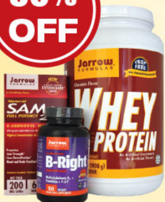
Jarrow Bonus Brand Buy