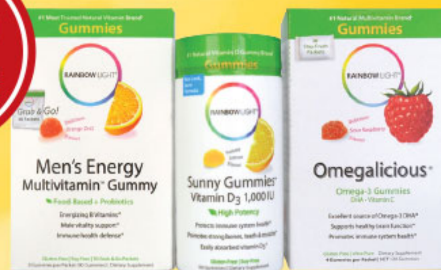
Rainbow Light Bonus Brand Buy