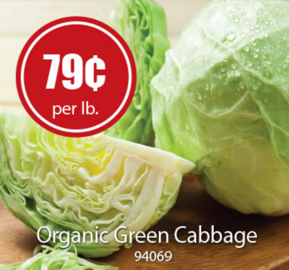
Organic Green Cabbage 94069