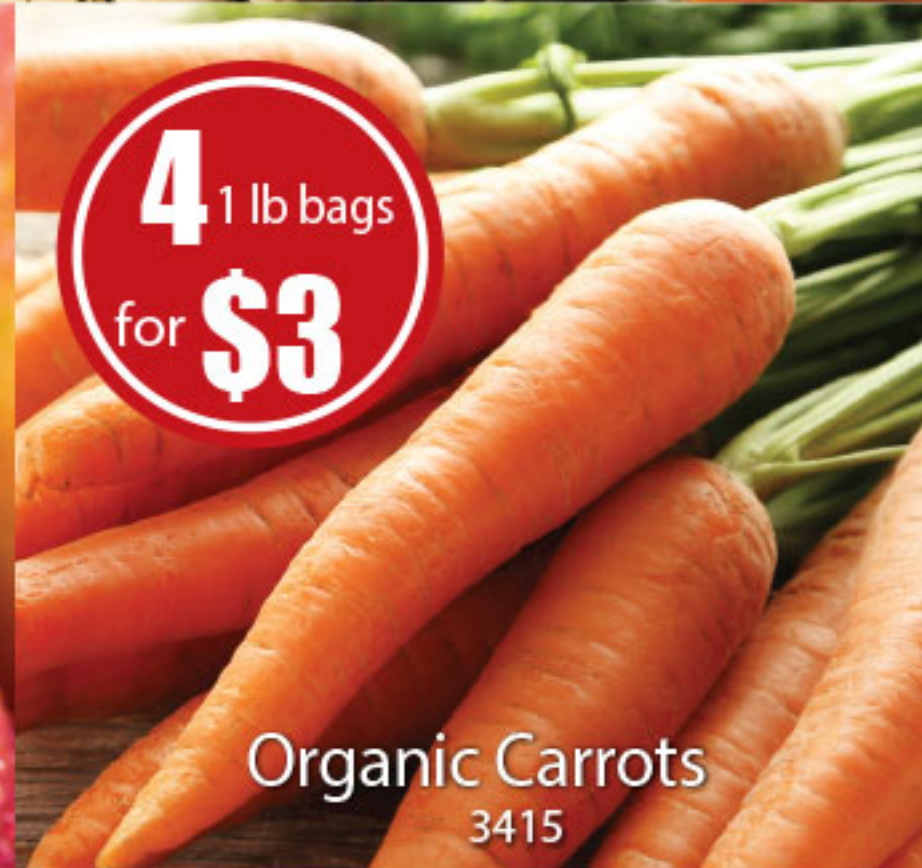
Organic Carrots 3415