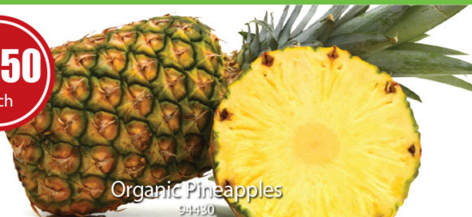
Organic Pineapples 94480