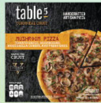
Table 5 Pizza $5.99 12.5-14 oz Select Varieties

Dr Praeger Bowls $4.89 6.3-8 oz Select Varieties