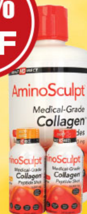
Health Direct Bonus Brand Buy