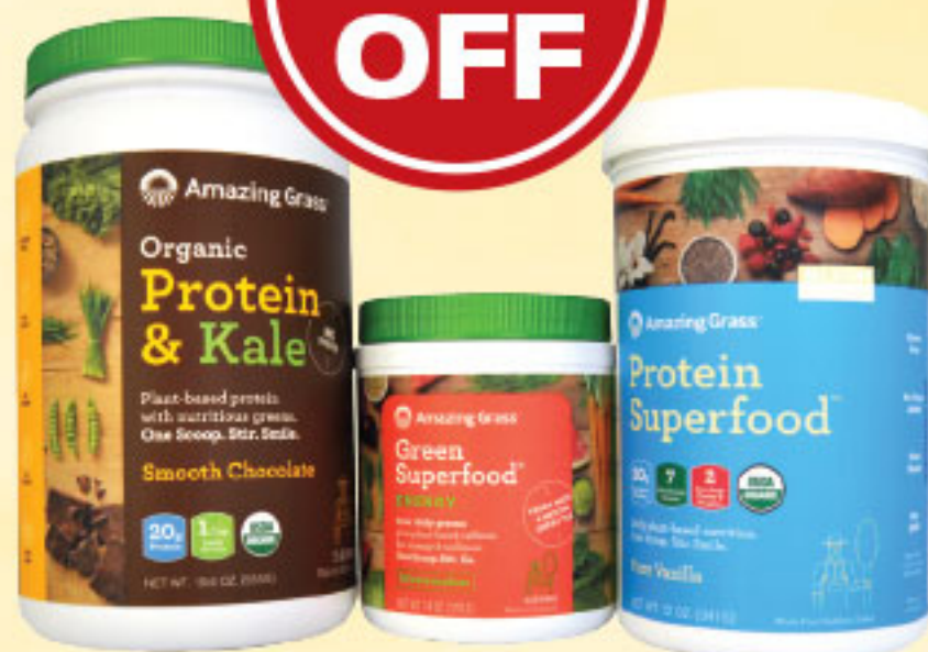
Amazing Grass Bonus Brand Buy