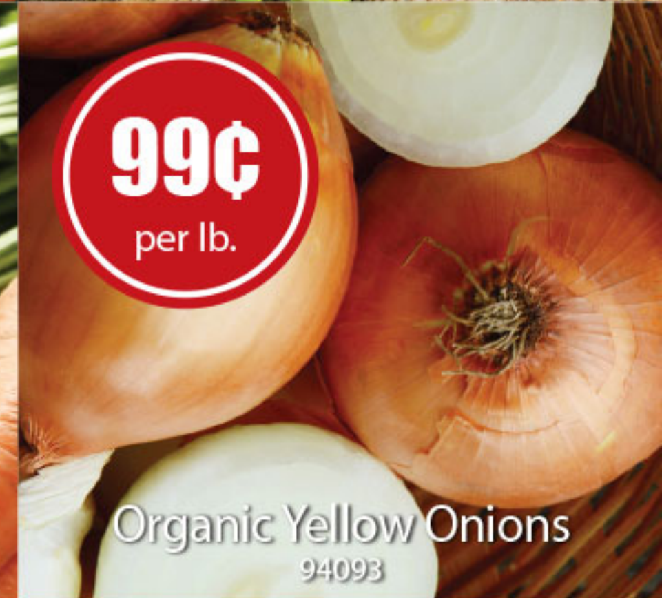
Organic Yellow Onions 94093