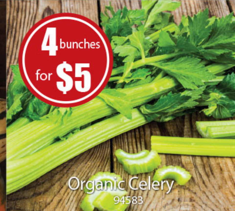
Organic Celery 94583