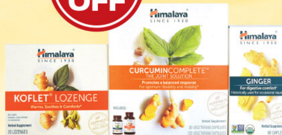
Himalaya Bonus Brand Buy