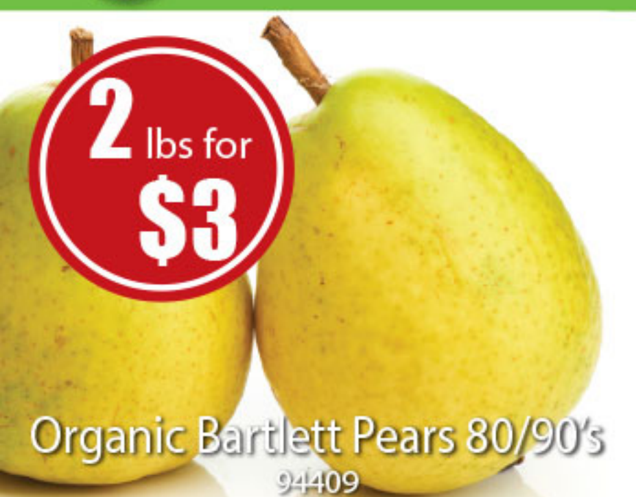
Organic Bartlett Pears 80/90's 94409