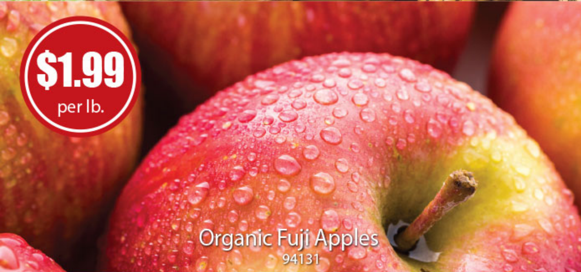
Organic Fuji Apples 94131