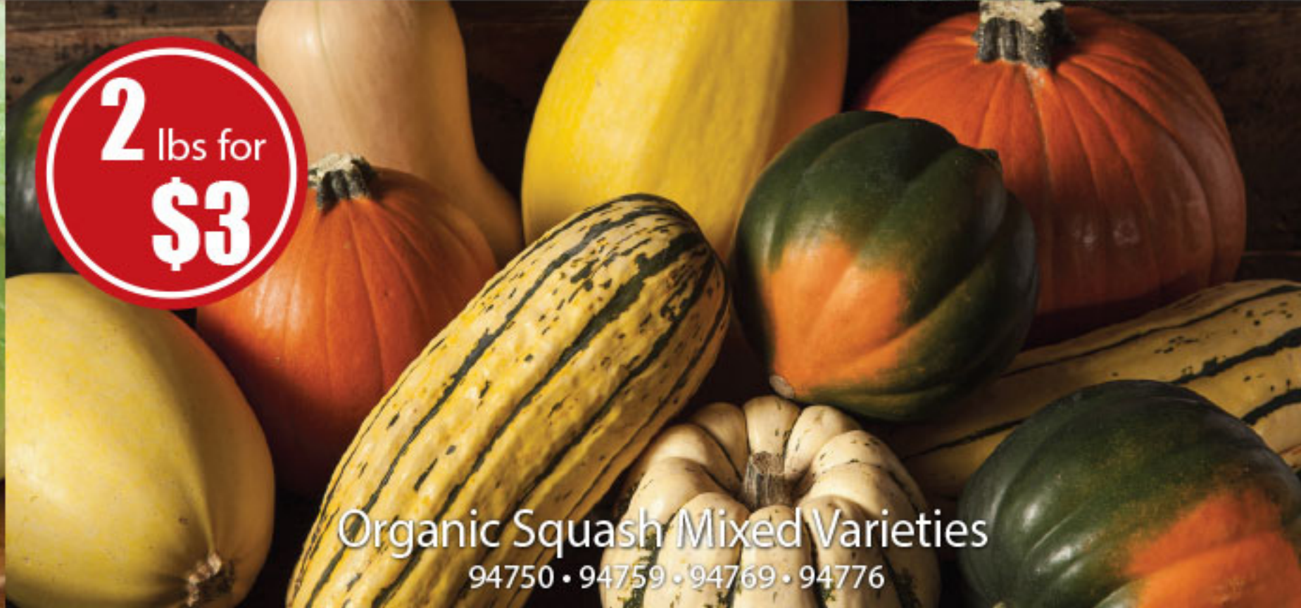
Organic Squash Mixed Varieties 94750 • 94759 • 94769 • 94776