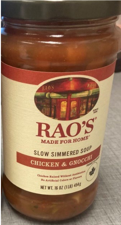
Figure 1: Improperly Labeled Soup Jar