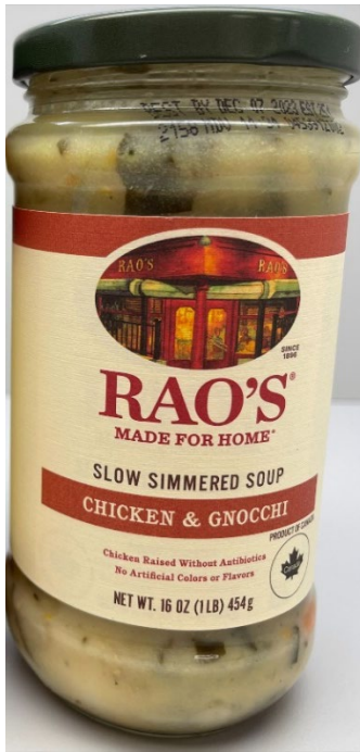
Figure 2: Correctly Labeled Soup Jar